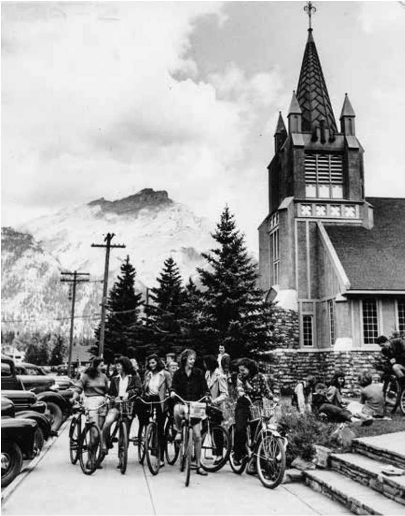
Banff Avenue scene, with students on bicycles and on the lawn of the Banff Auditorium, looking toward St. Paul's Presbyterian Church and Cascade Mountain, circa 1947 | Photograph by British Photographic Laboratories of Canada, Paul D. Fleck Library and Archives, M 14 01 26

The circuit of culture concept is useful to help us recall the complex forces at play in creating and sustaining the phenomenon of a fine arts school in a national park. In our perspective, the Banff School participated in a circuit of culture , a social reproduction of aesthetics, practices, and products that flowed from producers to consumers and back, with implications