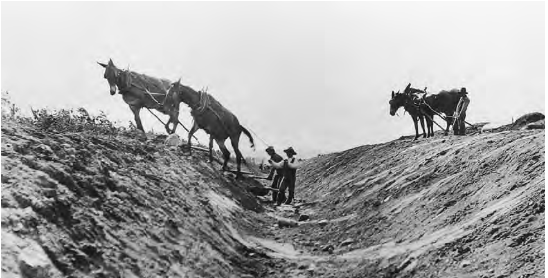
FIGURE 2 Men and horses digging a drain. This channel was located west of Lake Manitoba. The implements pictured are relatively simple, the sort that many farmers would have used on their farms.