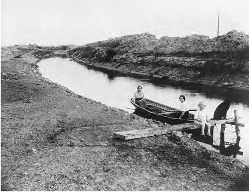
FIGURE 3 Boating in a drainage ditch near Woodside, Manitoba. This photograph is rare evidence of recreational engagement with Manitoba's drainage infrastructure. Note that both figures in the boat seem to be women, whereas workers on drainage projects typically were men.