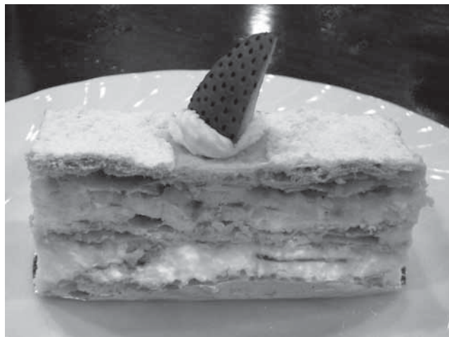
FIGURE 1.1 Mille-feuille cake SOURCE: http://en.wikipedia.org/wiki/Image:Mille-feuille_01.jpg .

Thus, in contrast to reductionist, isomorphic, and monodimensional approaches, it is methodologically imperative to view every sociospatial process as a complex crystallization of multiple, intertwined geographical dimensions and consequently to subject each of the latter to sustained analysis. In The Production of Space , Lefebvre (1991) develops this point through his thesis of the “superimposition and interpenetration of social spaces” (88). In one particularly vivid formulation, he likens the superimposed dimensions of social space to the intricate, asymmetrical layerings within a mille-feuille pastry – a powdery French dessert that means, literally, “a thousand leaves” (88). While Lefebvre’s somewhat fanciful culinary metaphor may distract us momentarily from the intricacies of sociospatial theory, it has direct implications for the discussion at hand. Like the mille-feuille , formations of USD are composed of complex articulations among multiple patterns, contours, lines,