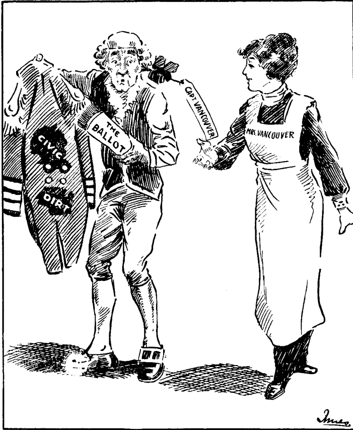
Mrs Vancouver – Just give me that brush, Captain, and you will not have half the trouble with your clothes in future.

This Vancouver Sun cartoon of 1913 illustrates the maternal feminist argument for enfranchisement. If “Mrs. Vancouver” wins the vote, she will clean up the political dirt and corruption that accumulate when men hoard political power.