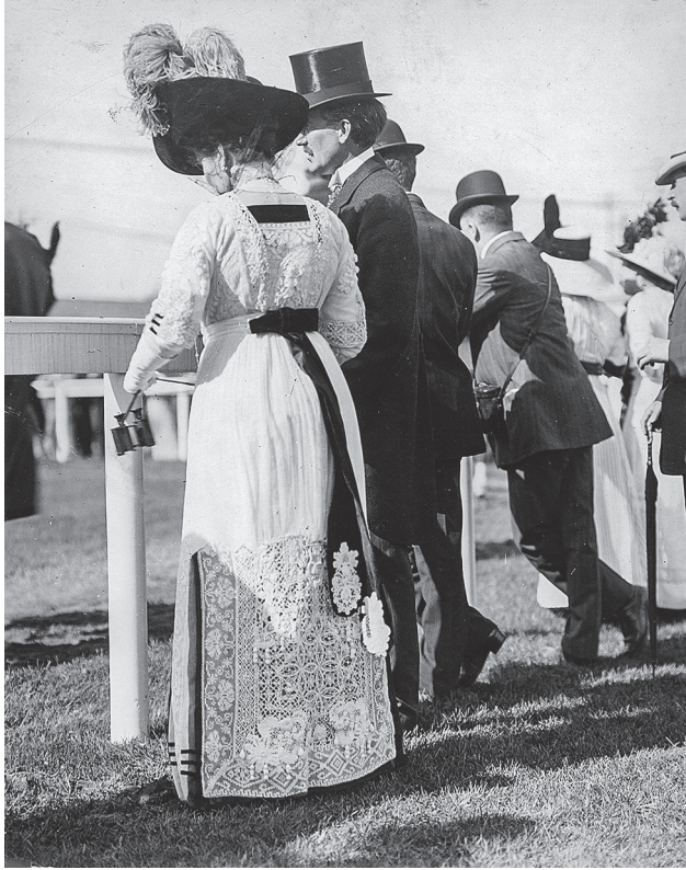
Finance Minister Thomas White and the Duchess of Connaught at an equestrian event, 1912

In the House of Commons, White was taunted for his switch of parties. Self-assured but not yet given to cut and thrust, he responded with a lengthy deconstruction of reciprocity, a speech that introduced the House to his penchant for detailed analysis. Regardless, long-time Edmonton MP (and former interior minister) Frank Oliver immediately classified White as anti-farmer. Liberal finance critic Alexander Kenneth Maclean, junior MP for Halifax (which he represented along with Borden), posed trenchant questions as a member of key standing committees, one on public accounts and the other on banking and commerce.